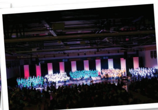
A birds-eye view of the District Elementary Festival