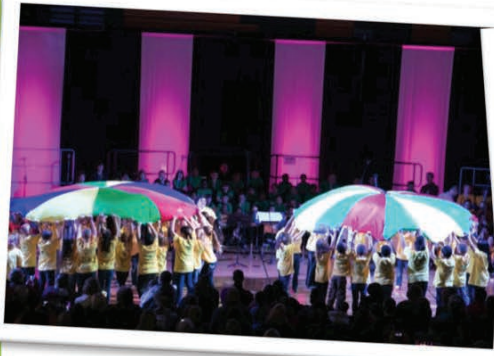
Winslow 3 rd graders dance with parachutes!