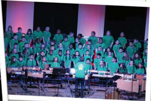
Leary 3 rd graders present an Orff ensemble & snowflake poems!